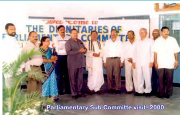
Parliamentary Sub Committee visit- 2000