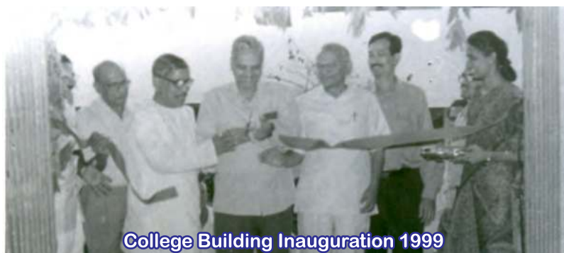
College Building Inauguration 1999

Pharm. D is a six year Doctor of pharmacy course, which is equivalent to post graduation in pharmacy. This course is clinical and hospital oriented. It encompasses the knowledge and training on drugs uses, actions, adverse reactions, clinical research and pharmacotherapeutic outcome.